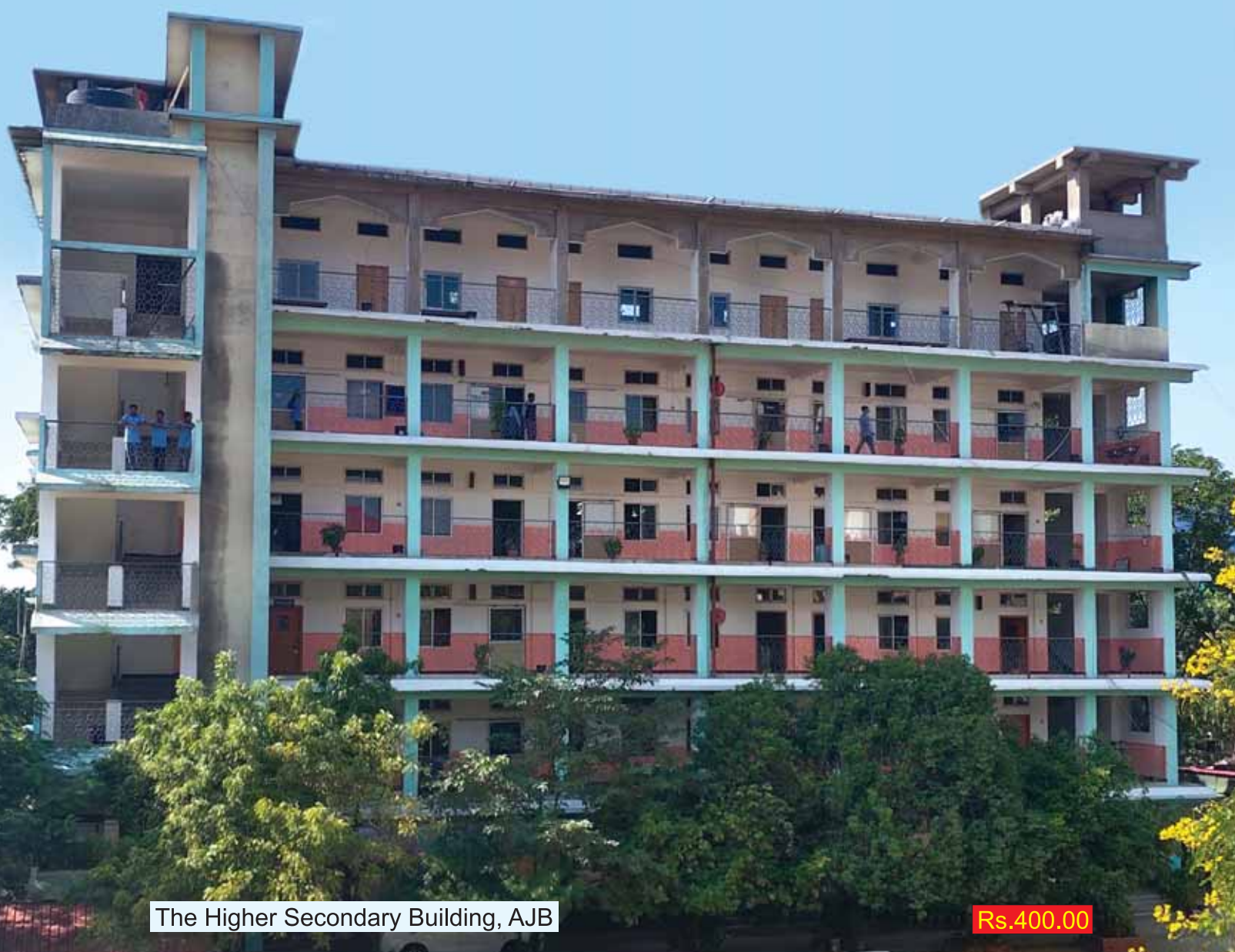
The Higher Secondary Building, AJB

All India Disaster Mitigation Institute has appreciated Assam Jatiya Bidyalay's Disaster Management Planning and Infrastructure facility. Assam State Disaster Management Department has recognized this institute as a Model School in Kamrup (Metro) District.