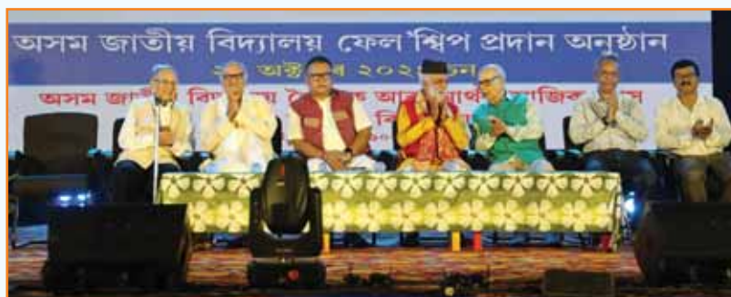
Assam Jatiya Bidyalay fellowship conferring ceremony, 2024